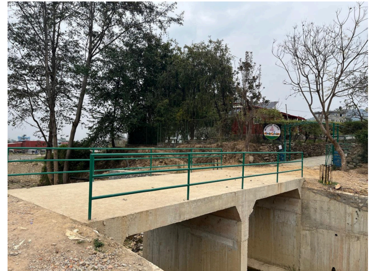
Ama Ghar's new bridge, which will protect the home from future flooding

Along with the bridge, we also made some other home repairs. I stayed home with the Ama Ghar dogs to supervise the refinishing of our floors (much needed after 12 years of daily kid traffic!) while the whole family took an extended seven-day