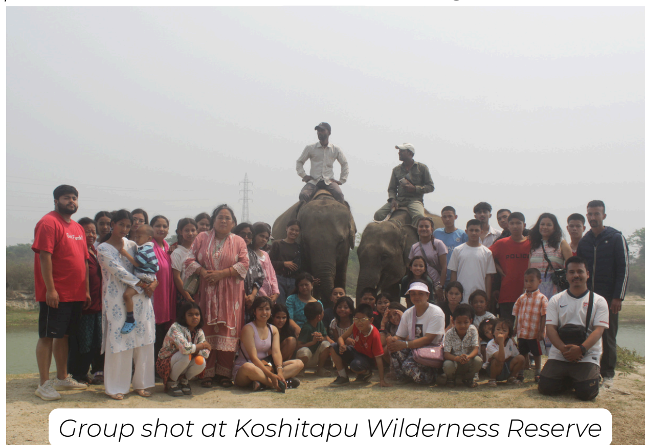
Group shot at Koshitapu Wilderness Reserve