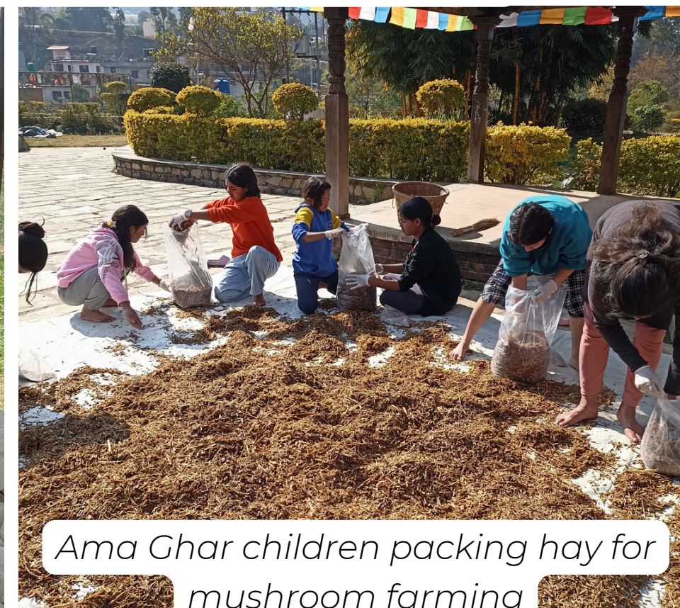
Ama Ghar children packing hay for mushroom farming