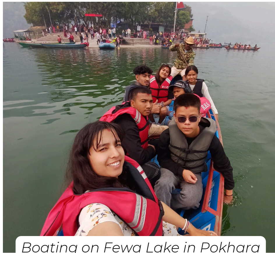
Boating on Fewa Lake in Pokhara