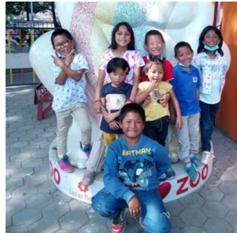
Amusement park group photo.