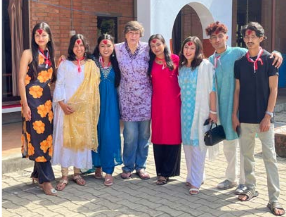
A group photo during Dashain.

2023 was full of celebrations. Outside of the many holidays we celebrate, we also celebrated several academic promotions and two Ama Ghar alumni weddings!