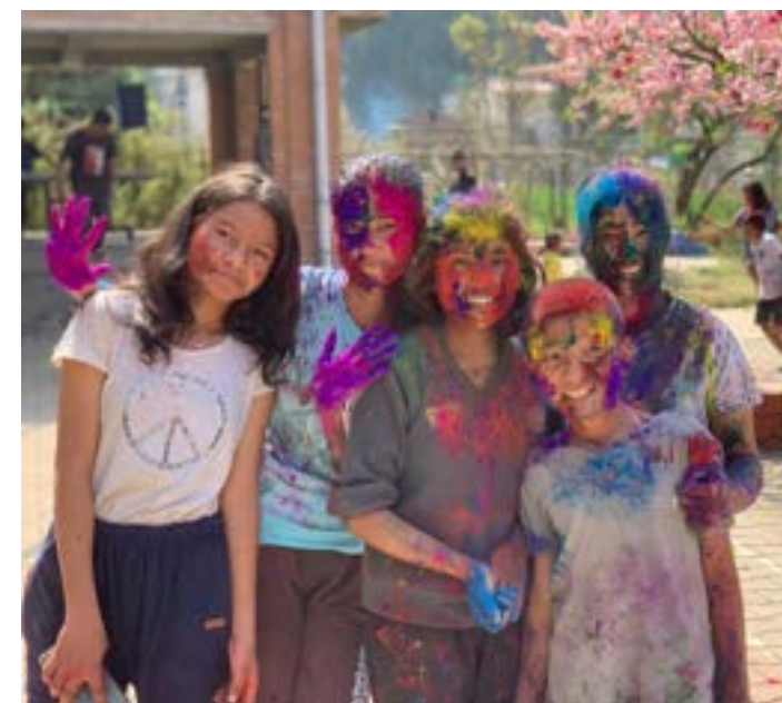
Holi 2023 at Ama Ghar