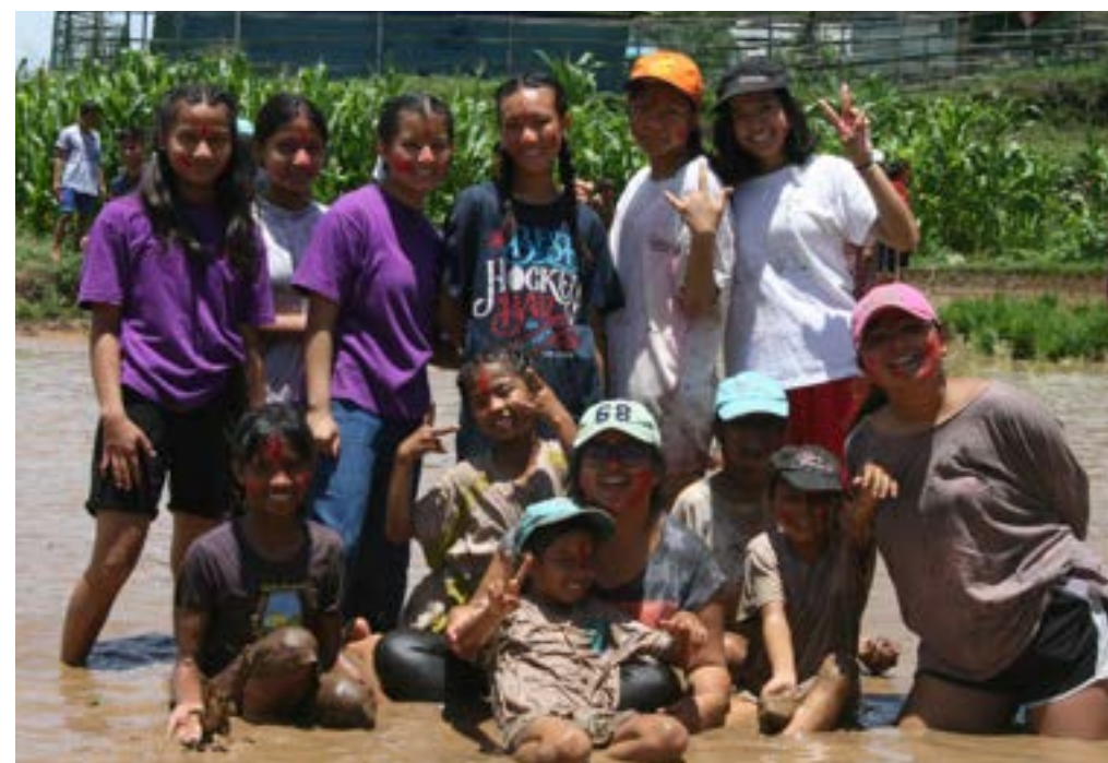
Group photo during rice planting.