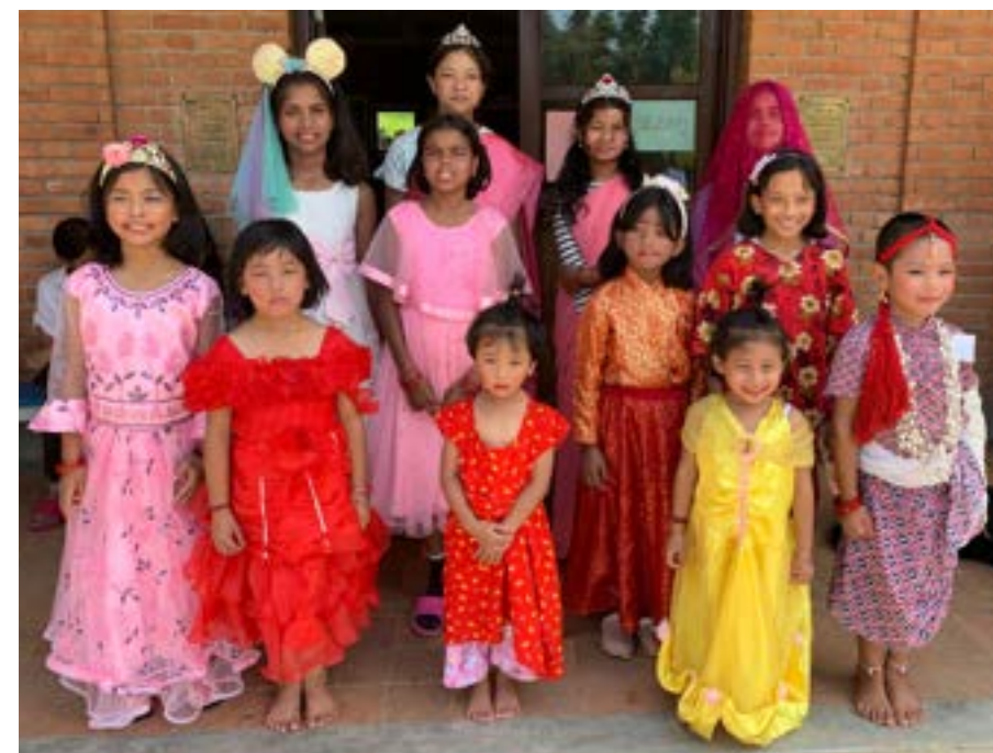
Celebrating Teej at Ama Ghar.