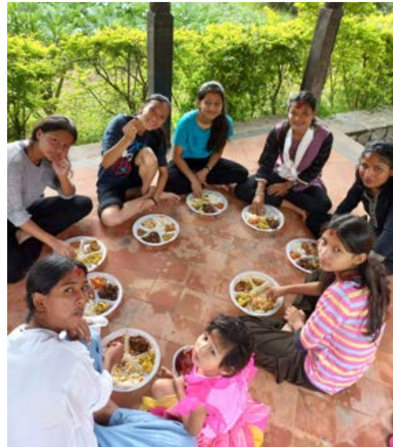
Enjoying lunch outside.