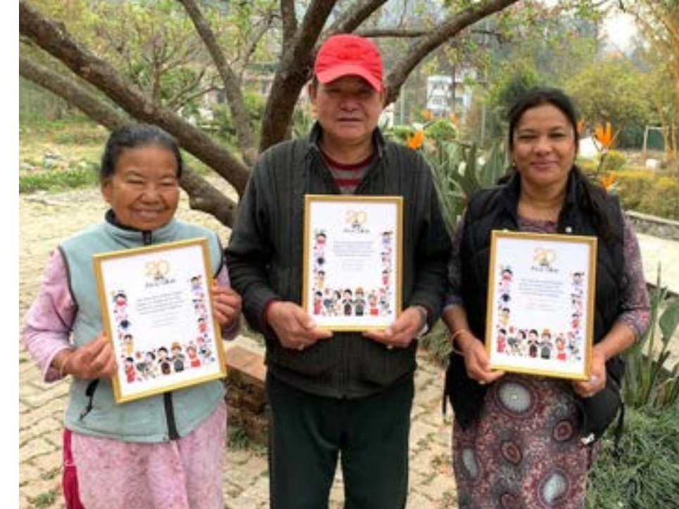
Honoring our staff who have dedicated 20 years to Ama Ghar.