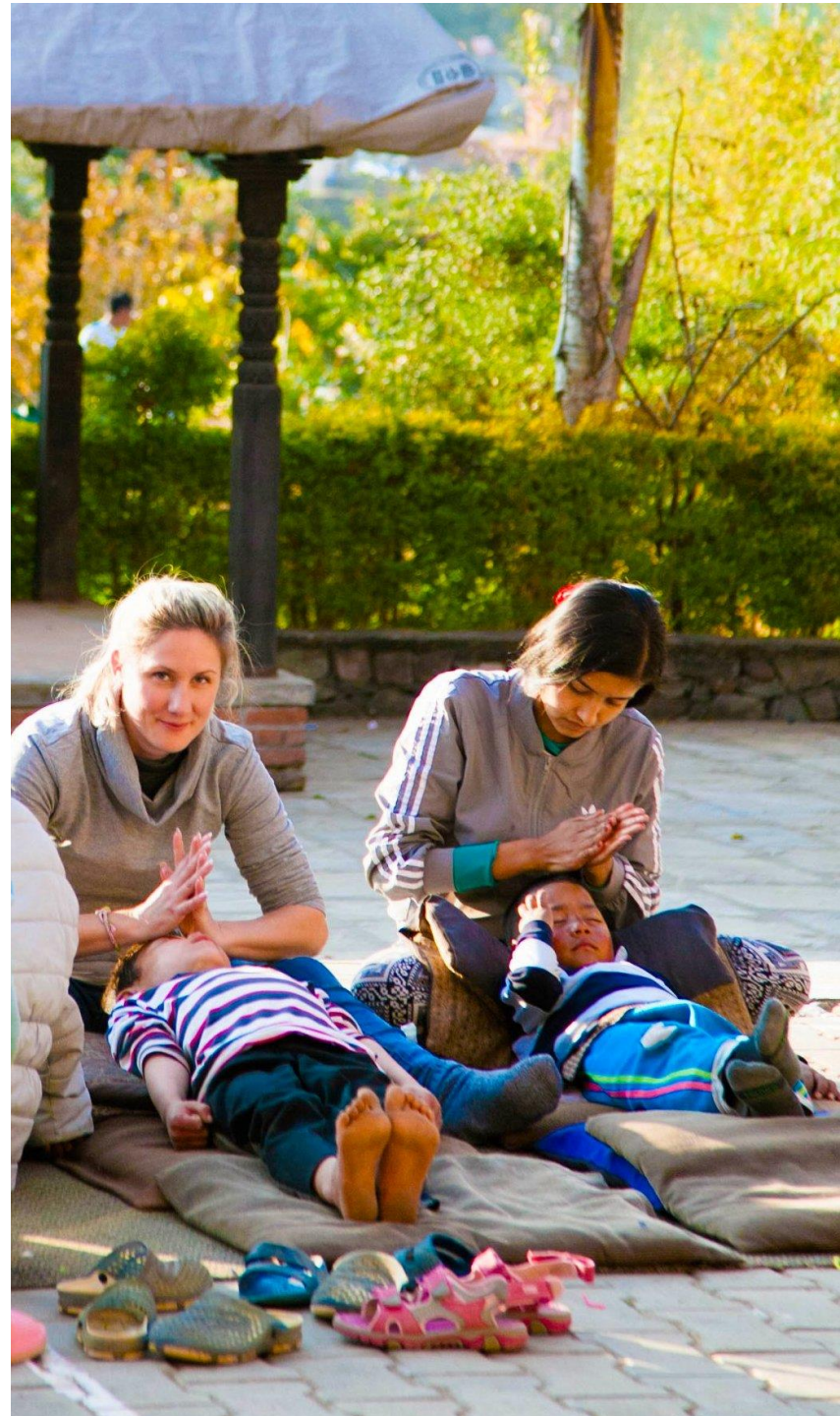
Photo: The Three Mums of Three Mums Do from the UK taught us how to give and receive massage during their visit. Photo by