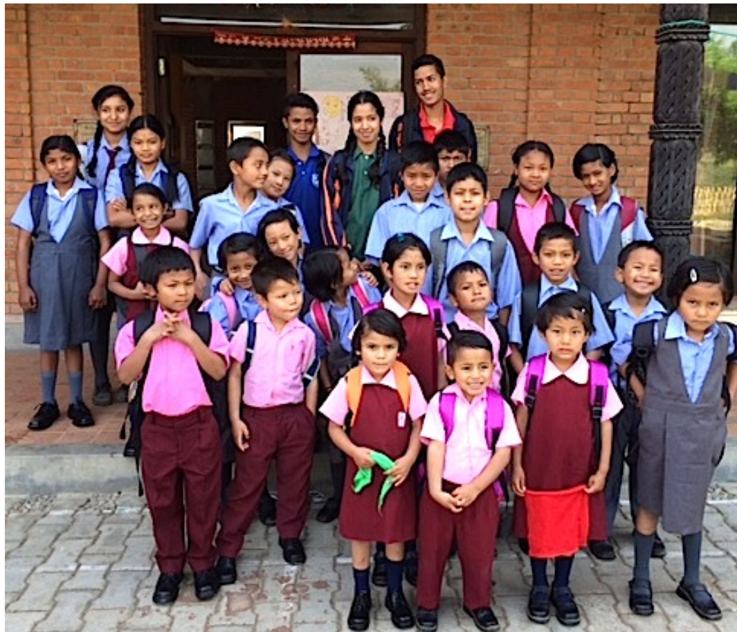
First day of school, 2016

The Ama Foundation is a grassroots US-based organization dedicated to providing the most underprivileged children of Nepal with a loving home, education and the opportunity to live healthy and secure lives within their community.