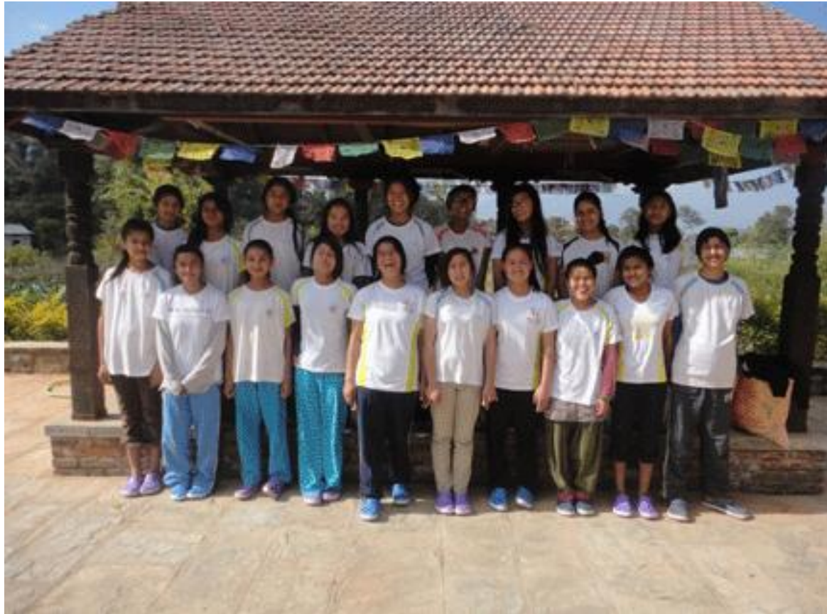
The children model race tee shirts donated to us by Destination Races

The Ama Foundation is a grassroots US-based non-profit organization dedicated to providing the most underprivileged children of Nepal with a loving home, education and opportunities to live healthy and secure lives within their community. The Ama Foundation is a California 501(c)(3) non profit corporation, Federal Tax ID #36-4478880.