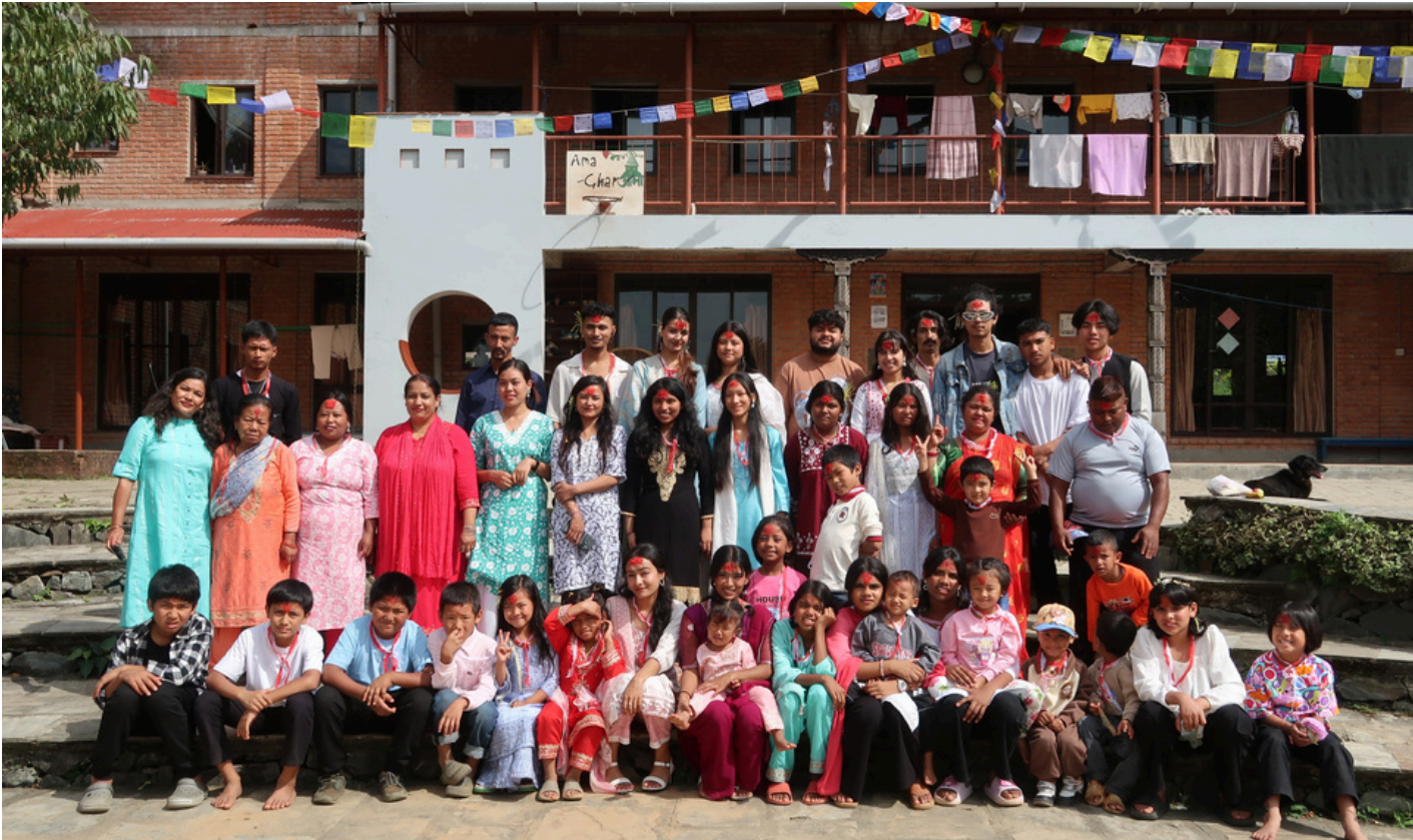
Tihar group photo at Ama Ghar

2024 was full of celebrations: Holidays, academic promotions, new Ama Ghar grandchildren, and more!