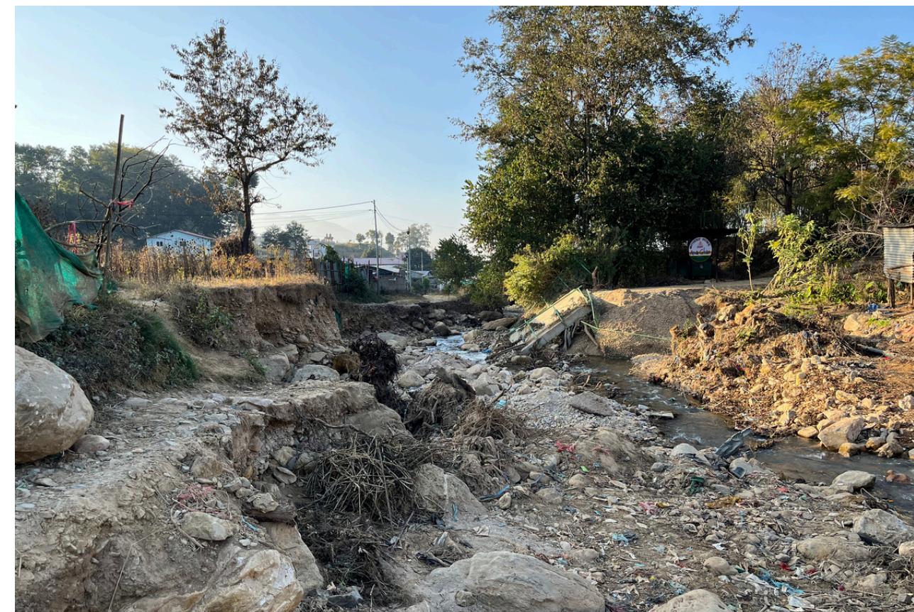
The aftermath of the floods: The road to Ama Ghar has been washed away.