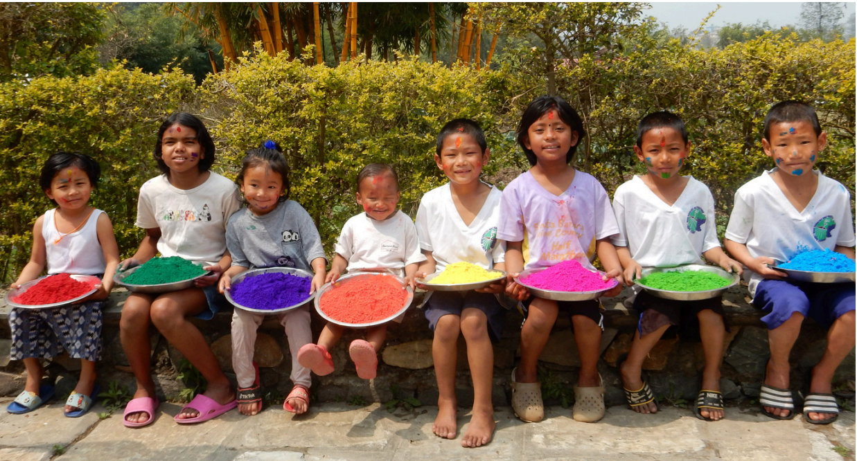
Group photo for Holi 2024