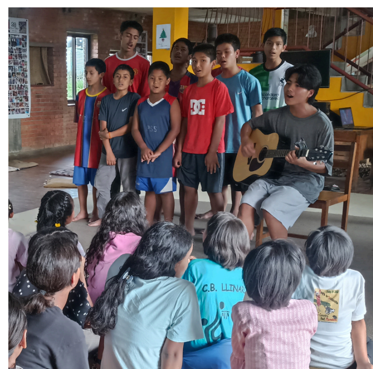
Ama Ghar boys musical performance