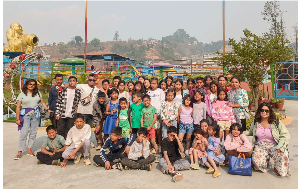
Group photo at Kathmandu Fun Valley

We strive to ensure that Ama Ghar children have a full, enriching childhood experience, which includes arts, sports, and fun outings together and in groups.