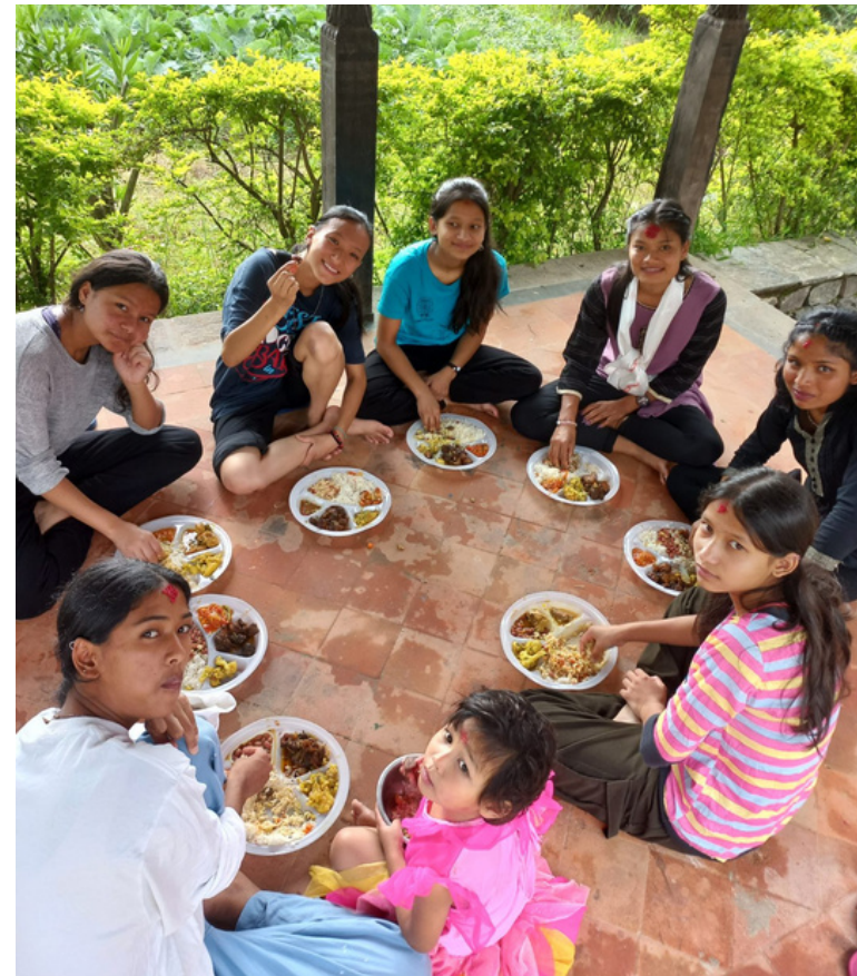
Enjoying lunch outside.