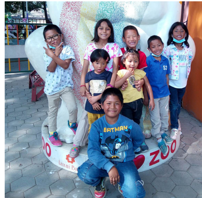
Amusement park group photo.