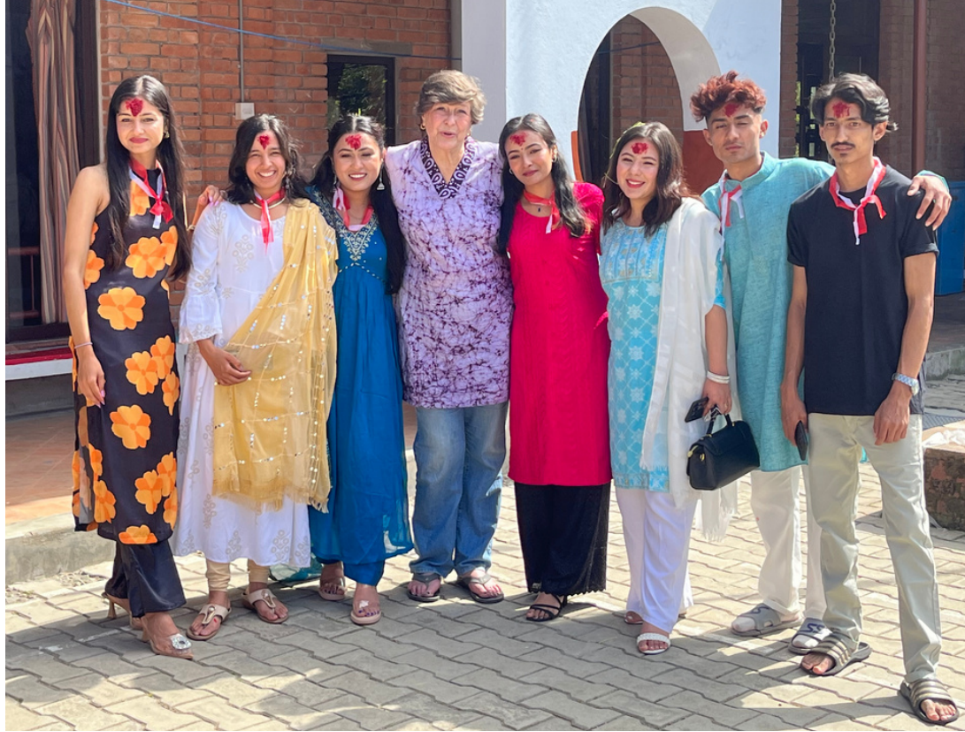
A group photo during Dashain.

2023 was full of celebrations. Outside of the many holidays we celebrate, we also celebrated several academic promotions and two Ama Ghar alumni weddings!