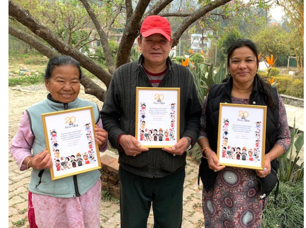
Honoring our staff who have dedicated 20 years to Ama Ghar.