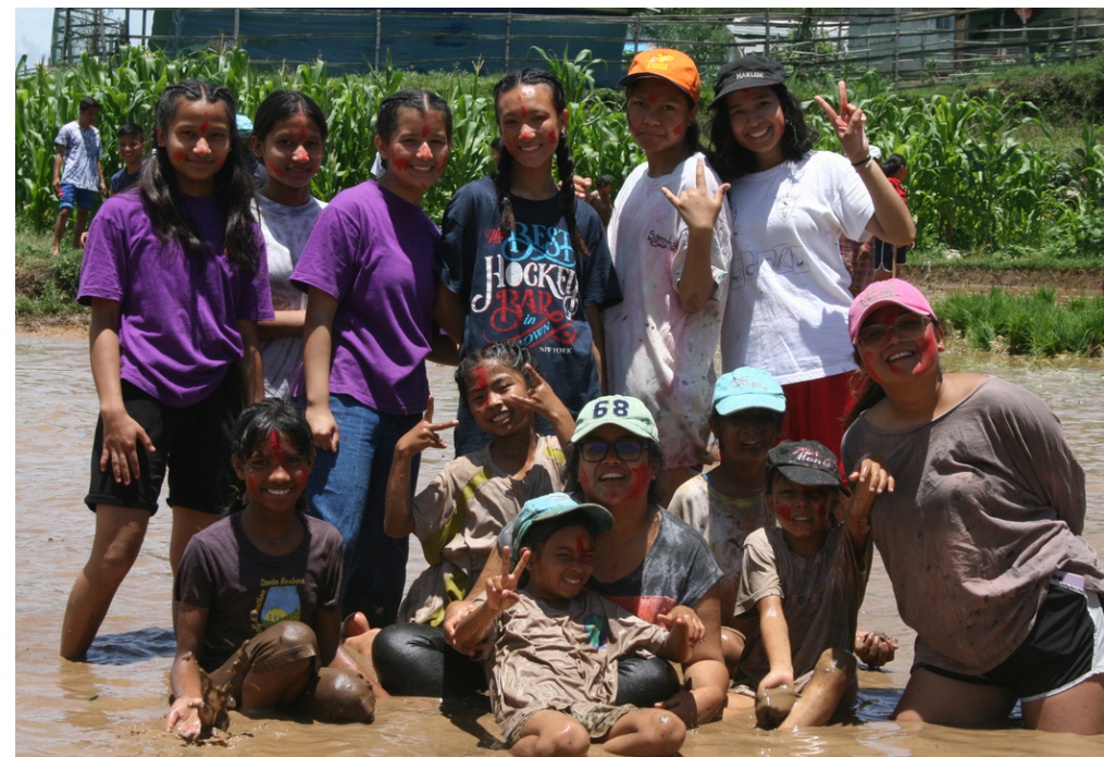
Group photo during rice planting.