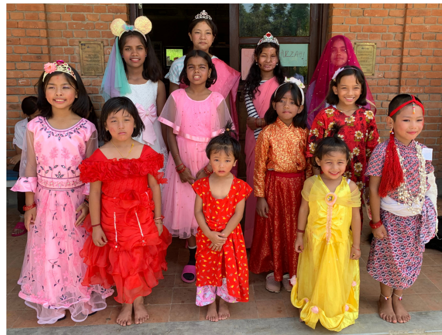
Celebrating Teej at Ama Ghar.