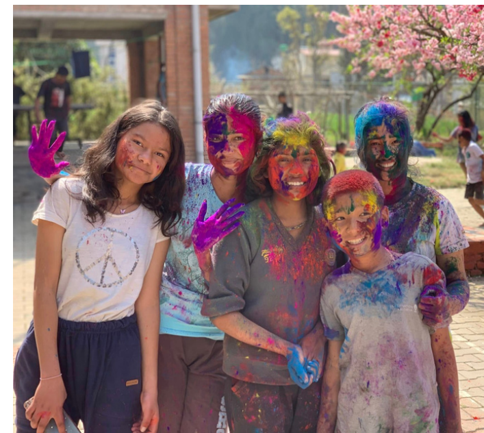
Holi 2023 at Ama Ghar